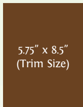
5.75" x 8.5" (Trim Size) Full Page Special Position